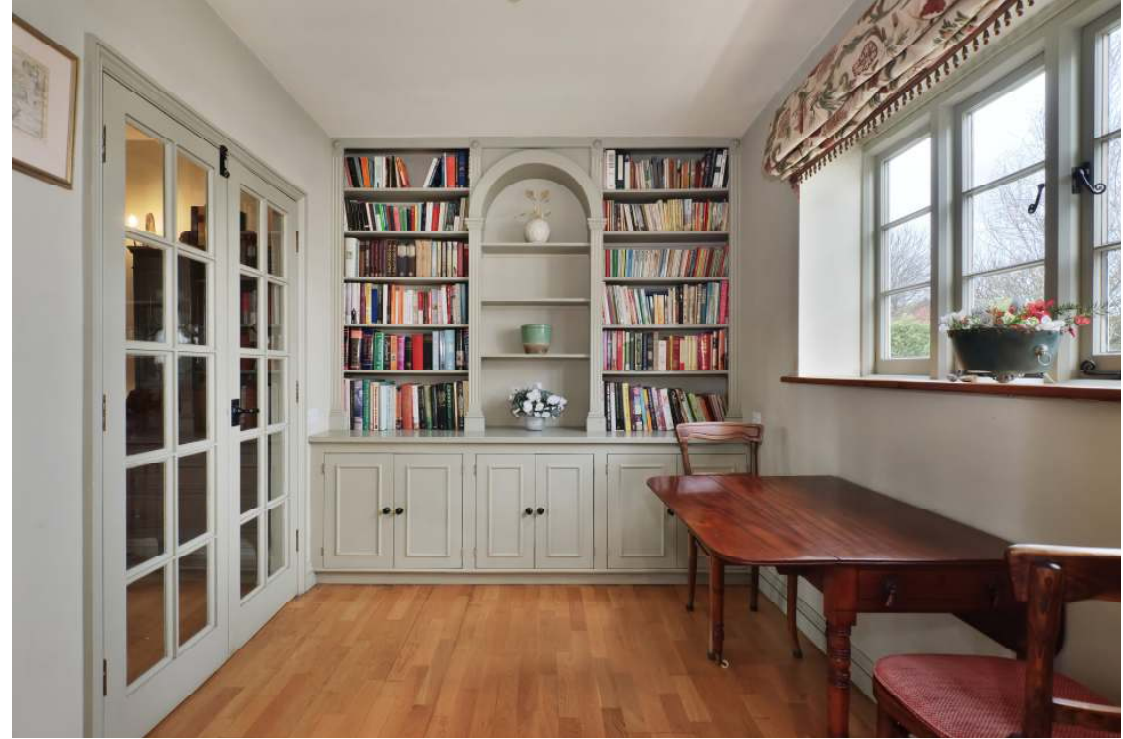
Main living room, breakfast room and adjoining kitchen