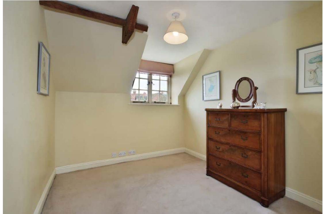
Three bedrooms with supporting bathroom